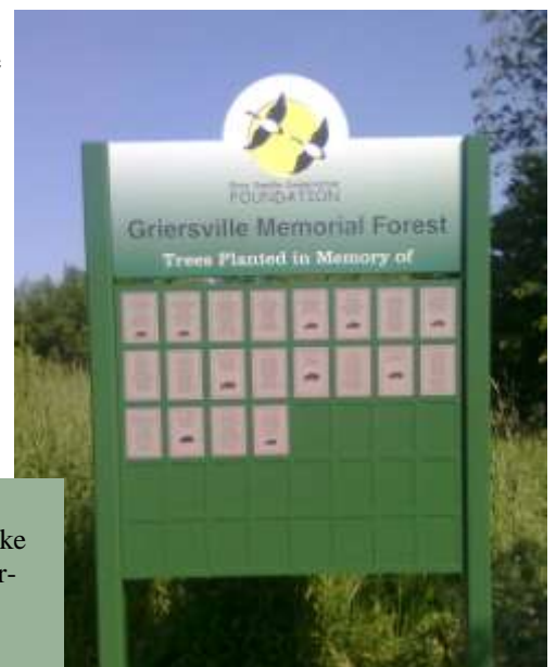
The new plaque sign at Griersville

The Memorial Forest Committee is working with staff to complete the final two Memorial Plaque Signs, Pottawatomi and Big Mud Lake. The signs will be installed in the spring, 2014.