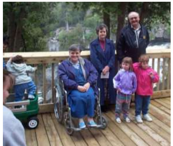
2000 Wheelchair accessible viewing platform at Inglis Falls Conservation Area.

...the Foundation was established in 1993 and is a Federally registered, charitable, not-for-profit organization that raises money to assist Grey Sauble Conservation fund programs and projects. Past Projects throughout the years: Bognor Marsh Management Area boardwalk; Inglis Falls Conservation Area - Arboretum pavilion, trails and interpretive signs; trail clean-up at Eugenia Falls Conservation Area. On-going Program Assistance: Wildwater (spring ice-water safety for Grades 4 and 5) and BioMap Water Quality Monitoring.